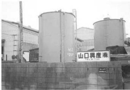
Tank for storing waste oil