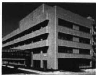
Organic and Inorganic Surface Analysis Laboratory