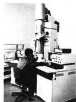
Ultra-high Resolution Transmission Electron Microscope