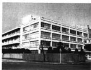
Functional Materials Analysis Laboratory