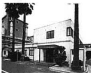
Pharmaceuticals and Agricultural Chemicals Analysis Laboratory