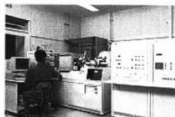
High Resolution Liquid Chromatography Mass Spectrometer