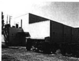
Morphology Analysis Laboratory