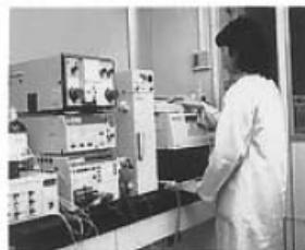
Liquid Chromatograph Mass Spectrometer