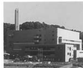
Koji Clean Center