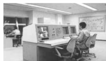
Control room for garbage disposal treatment facility

Incinerator environmental and sanitary system, communication for prevention of disasters, highway monitoring system, fire fighting and prevention of disasters system