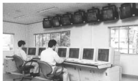
Centralized operation room for calcination facility

We offer integrated systems; Centralized monitoring control for irrigation and draining semiconductor, facilities for steel, chemistry, food